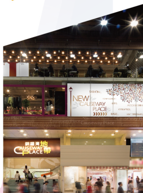
Causeway Place, Hong Kong