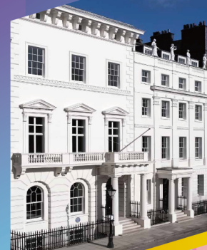
11 and 12 St James's Square and 14 to 17 Ormond Yard, London