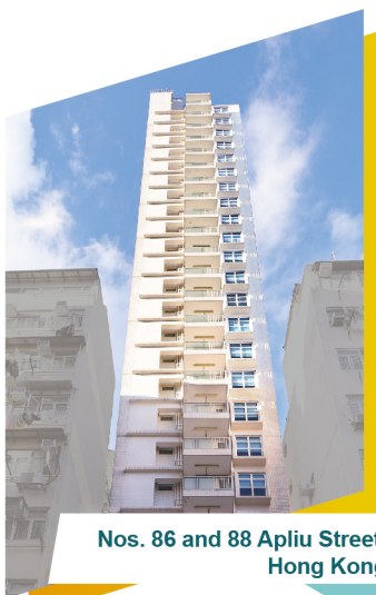
Nos. 86 and 88 Apliu Street, Hong Kong