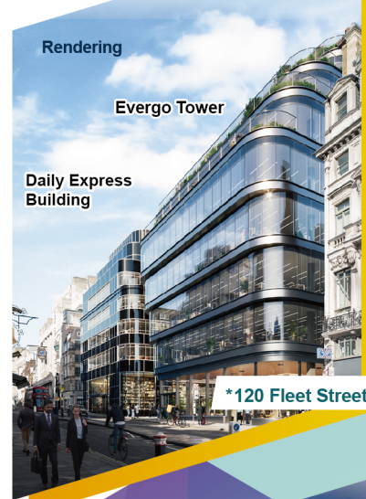
*120 Fleet Street, London