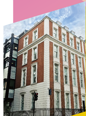
14 St George Street, London