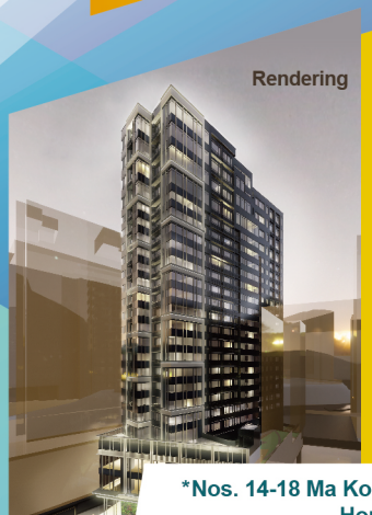
*Nos. 14-18 Ma Kok Street, Hong Kong