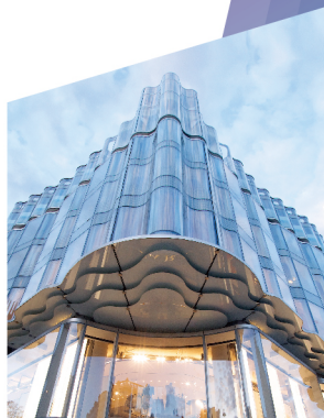
61-67 Oxford Street and 11-14 Soho Street, London