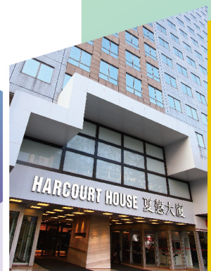
Harcourt House, Hong Kong